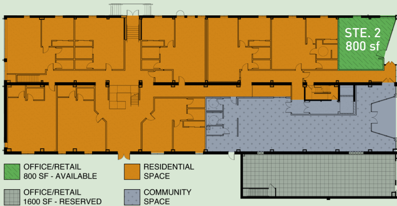
ARTSPACE HAMILTON LOFTS - FIRST FLOOR PLAN