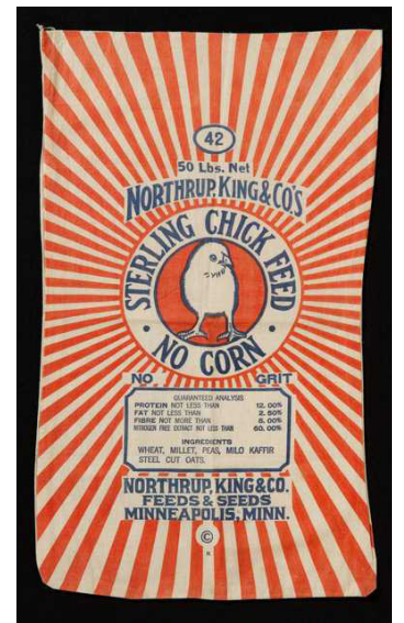
Above: Chick Feed packaging from Northrup King & Co. Below: Workers sort seed packets the Northrup King complex.

Today the revived NKB is renowned as an extraordinary hub for the arts, and Artspace's ownership ensures that the space remains code compliant, artistically appropriate, and affordable for artists and innovators who have contributed much to the culture of Northeast Minneapolis and beyond.