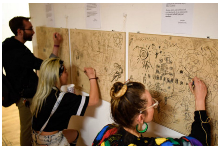
Clockwise from top left: Angel Bomb letterpress studio; Tres Leches gallery; Art-a-Whirl interactive event, courtesy of the Star Tribune.