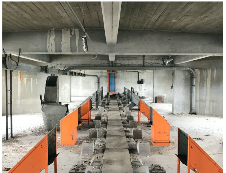
Left: Sign above the Jackson Street entrance. Right: Inside the old grain silos.