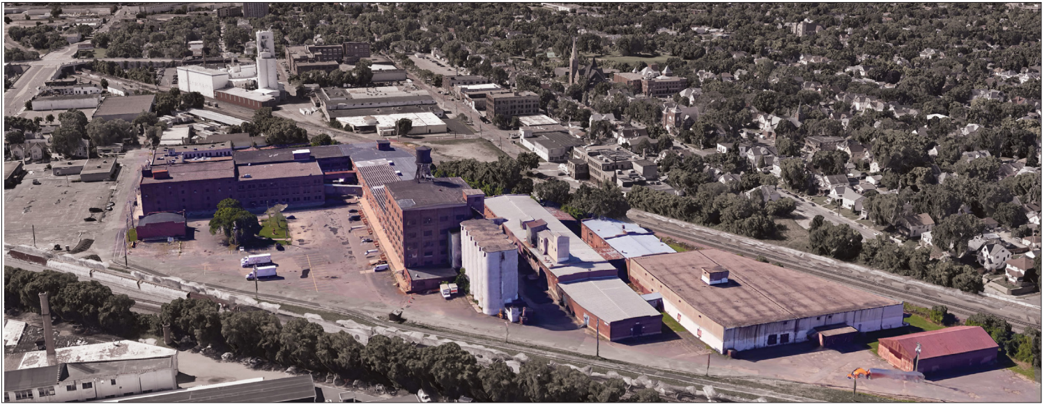
Above: The Northrup King complex. The campus is comprised of 13 buildings, with six occupied and seven vacant.