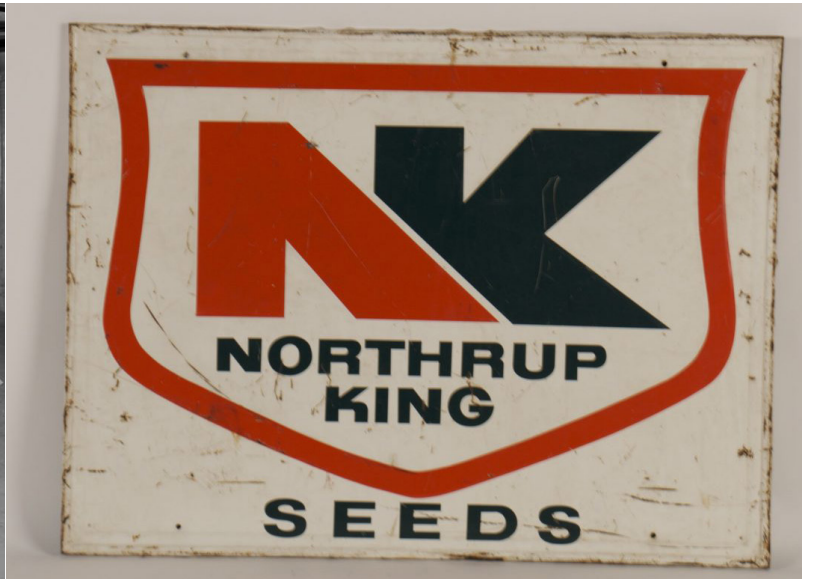
Left: Workers loading seed bags in the Northrup King complex. Right: Original Northrup King Seeds sign.