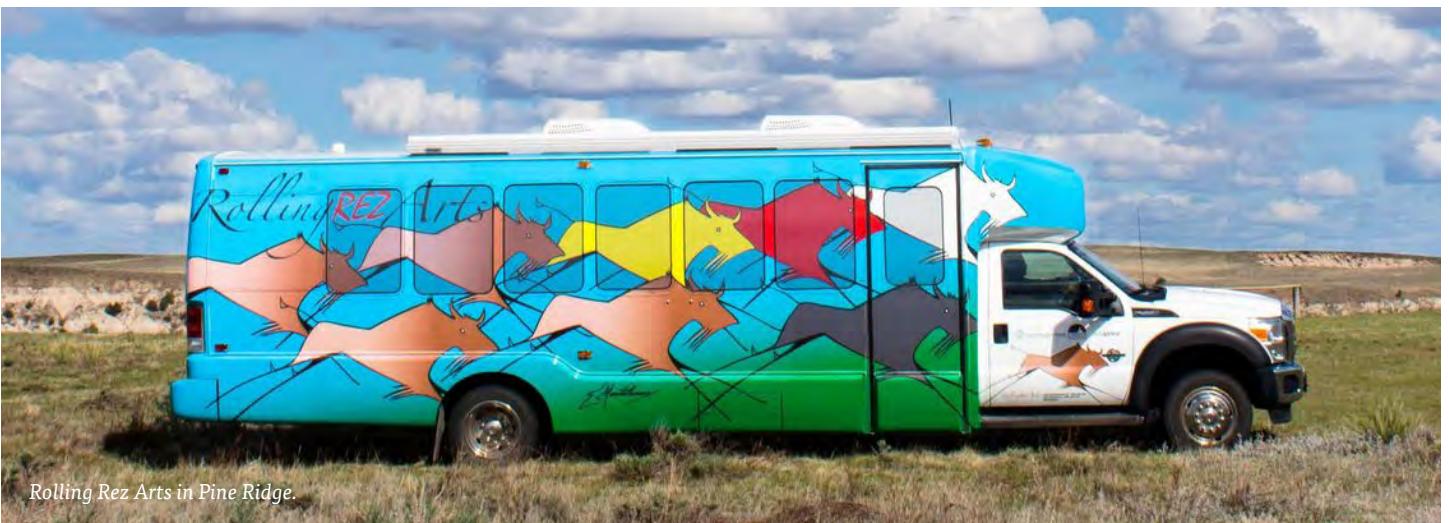
Rolling Rez Arts in Pine Ridge.

The Oglala Lakota Artspace will be located in Kyle, South Dakota. The $2.75 million project is scheduled for completion near the end of 2019 and will be located in close proximity to the Pine Ridge Area Chamber of Commerce, the Lakota Prairie Ranch Resort, Oglala Lakota College, and Thunder Valley Community Development Corporation.