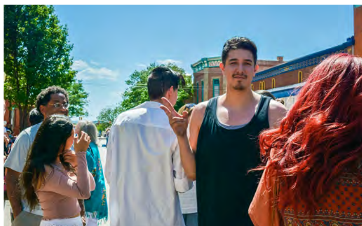
Photos on this page, clockwise: Trinidad Space to Create supporters participate in the shovel ceremony; FloBots and 2XM performed; Crowds along Main Street; A lineup of supporters, funders, and Artspacers with their ceremonial shovels.