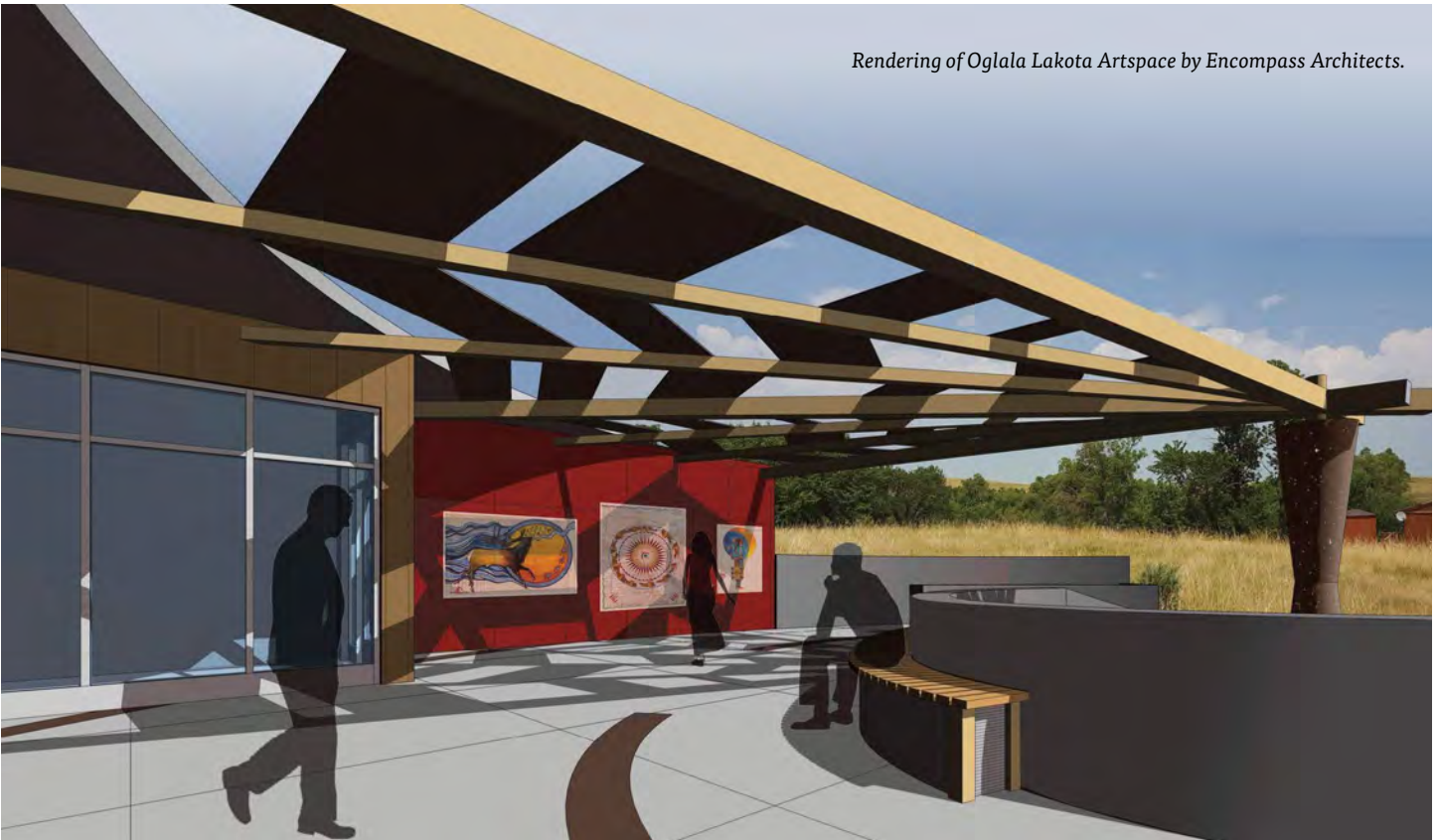
Rendering of Oglala Lakota Artspace by Encompass Architects.