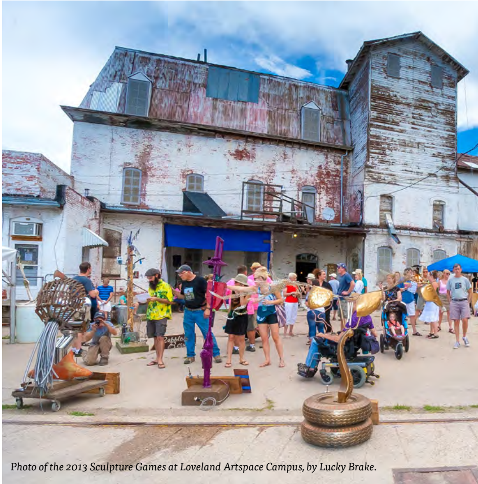
Photo of the 2013 Sculpture Games at Loveland Artspace Campus, by Lucky Brake.