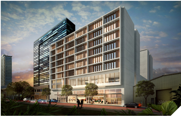
Rendering of Ola Ka 'Ilima Artspace Lofts