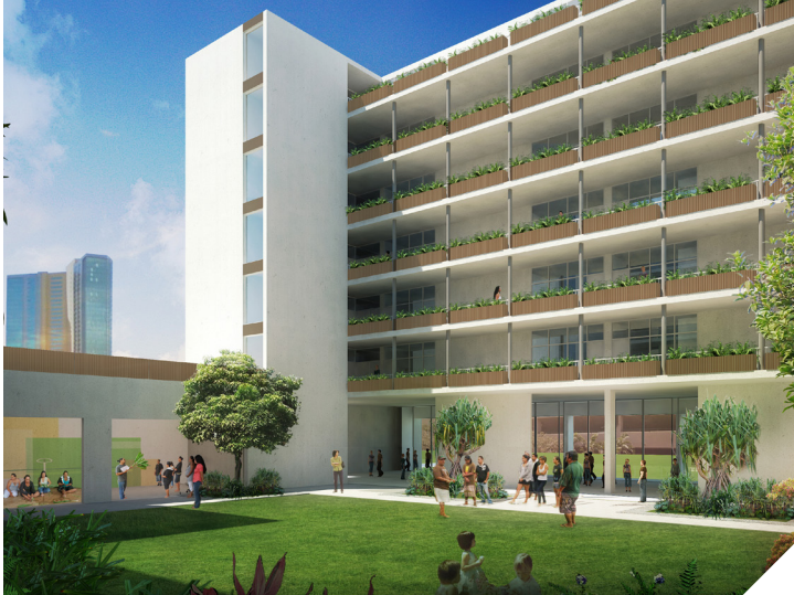
Rendering of Ola Ka 'Ilima Artspace Lofts

A total project budget of $40 million is currently projected, of which approximately $4 million will need to come from private sources. The National Endowment for the Arts, the Ford Foundation, and ArtPlace have provided preliminary philanthropic support. Ample recognition opportunities will be developed, including permanent naming rights to prominent spaces.